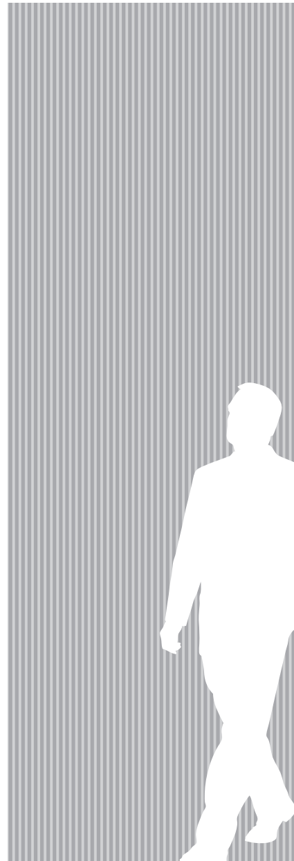
Full Sheet Pattern