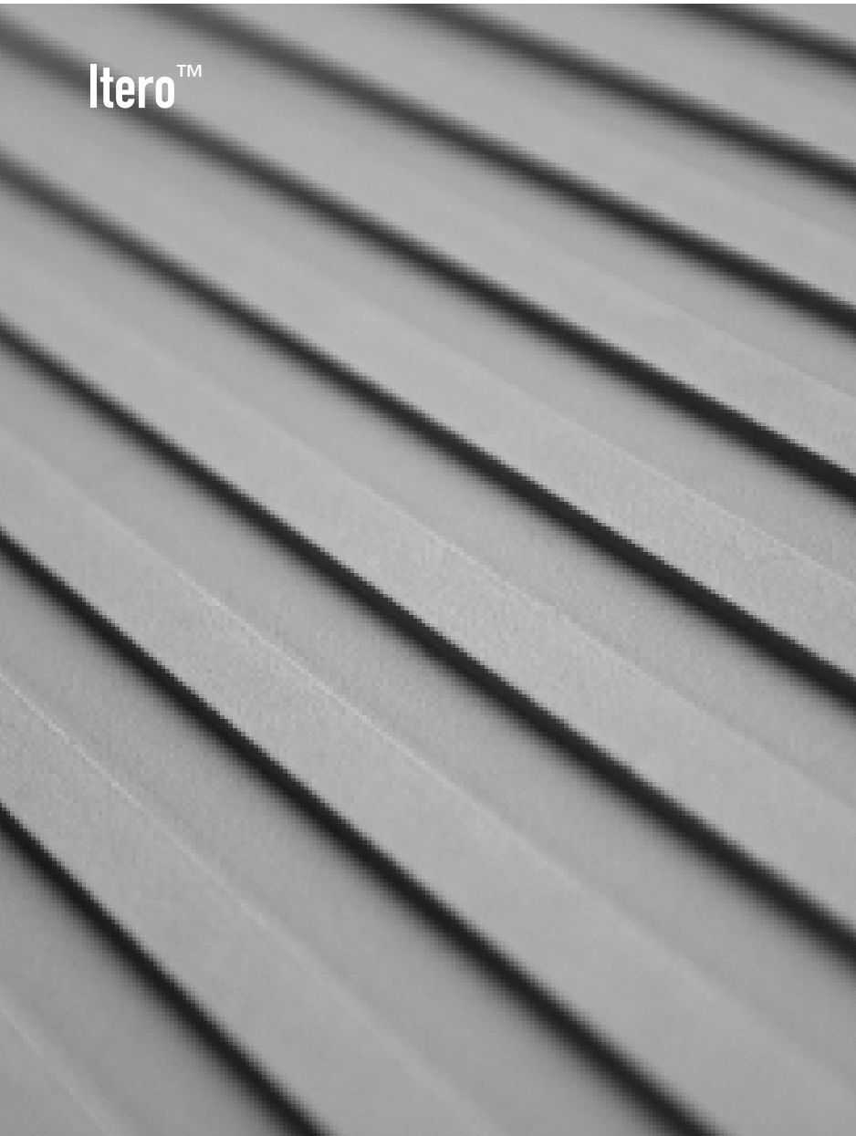
Texture Detail 3:1